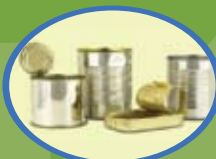
Clean Steel and Tin Metal Containers