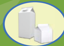
Clean Milk and Juice Cartons