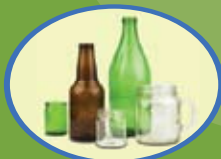
Clean Glass Bottles and Jars