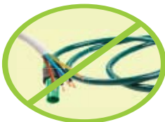
NO Garden Hoses, Cords, Ropes, or Wires