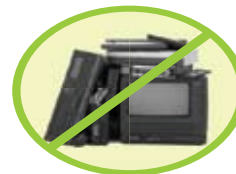
NO Electronics (recycle at a Community Collection Center)