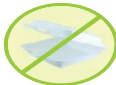
NO Polystyrene Foam or Styrofoam™