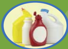
Clean Plastic Bottles and Containers (caps on)