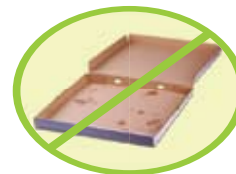
NO Soiled Paper Items