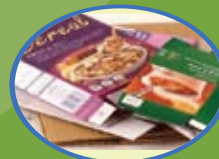
Dry Paperboard Boxes