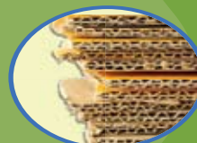
Dry Flattened Cardboard