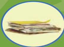
Dry Paper, Newspaper, and Junk Mail