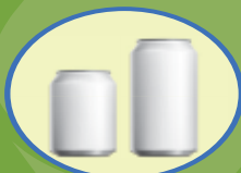
Clean Aluminum Cans