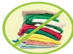
NO Clothing, Shoes, or Textiles