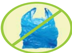
NO Plastic Bags or Film