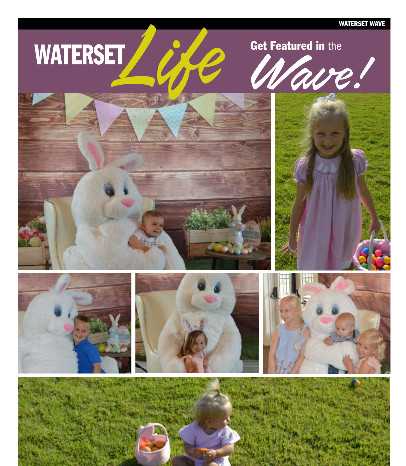
Waterset | http://www.watersetonline.com/waterset/